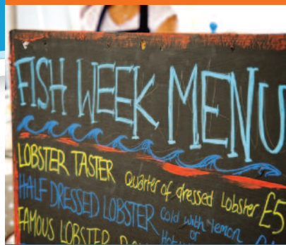
Hwyl i'r teulu!