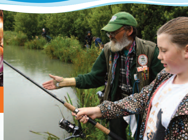
Enjoy the great outdoors?