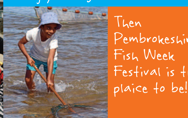
Then Pembrokeshire Fish Week Festival is the place to be!

Packed with events and activities for all ages and tastes across the county of Pembrokeshire. Come along and join the fun!