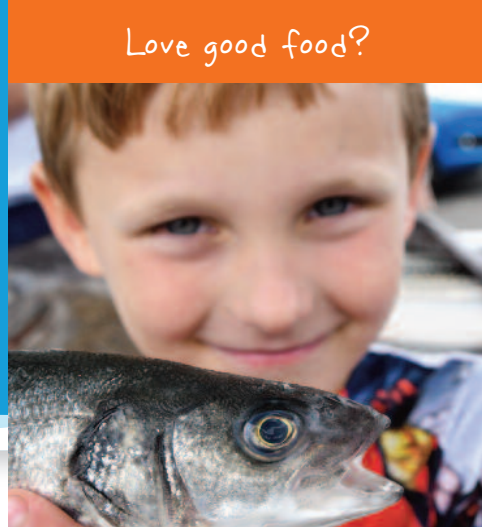
Love good food?