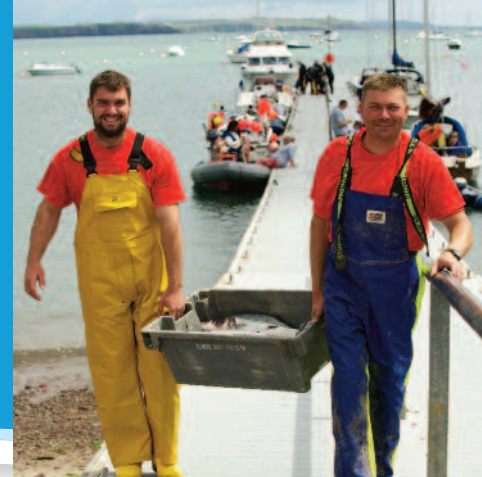
Enjoy the great outdoors!

2019 sees the festivals launch event return to Milford Haven with a free fun day at Mackerel Quay for Milford Fish Festival. Packed with family fun, street food, fishy