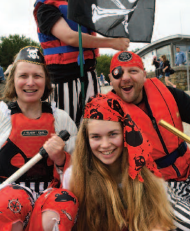
Or just want some fun with the family?