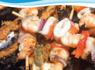
Love good food?